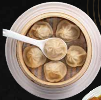
Xiao Long Bao

Xiao Long Bao $13.95 小笼包 Pork soup dumplings