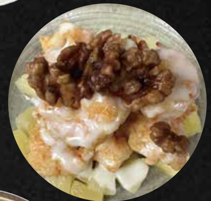
Pineapple Shrimp with Walnuts

Seafood Festival $26.95 海鲜大会 Jumbo shrimp, scallop, squid, fish tofu & vegetables in a light wine garlic sauce