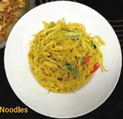
Singapore Rice Noodles

Pad Thai with Peanuts $15.95 Choice of thin egg noodle or rice noodle with shrimp & chicken, scallions, bean sprouts