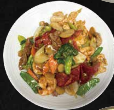
Happy Family Special