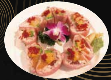
Feng Shui Maki