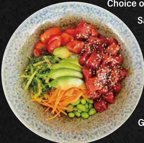
Tuna Poke Bowl