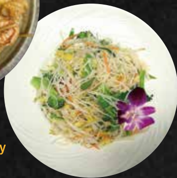
Rice Noodle Stir-Fry