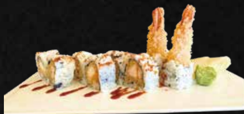
Shrimp Tempura Maki