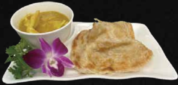
Roti Canai (Malaysian Flat Bread) 🍴