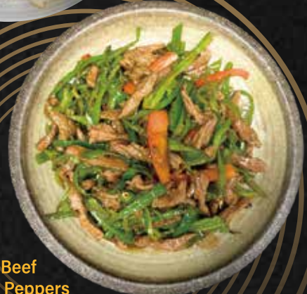
Shredded Beef with Longhorn Peppers