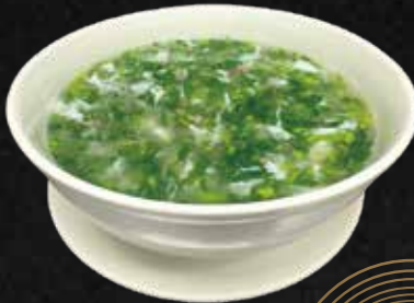
West Lake Beef Soup