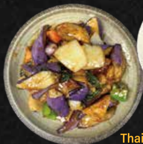
Thai Basil Eggplant with Tofu