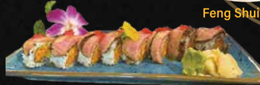
Tuna Family Maki*

Spicy tuna, spicy salmon, avocado, cucumber wrapped with soybean paper, topped with yellowtail, jalapeno, salmon roe, honey wasabi & miso sauce