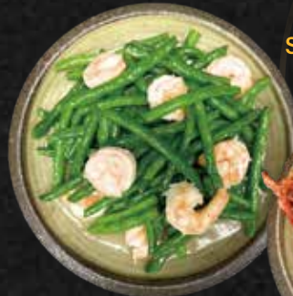
Shrimp with String Beans

Shrimp with Mixed Vegetables $17.95 Shrimp with String Beans $17.95 Shrimp with Garlic Sauce $17.95 Scallop with Mixed Vegetables $20.95 Scallop with Garlic Sauce $20.95