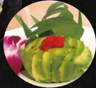
Avocado Bomb / Salad*