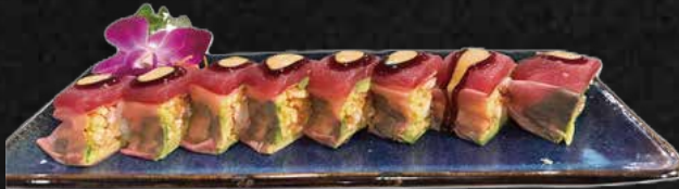
Lobster Roll*(no rice)