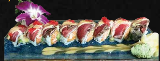
Sex On The Beach Maki*