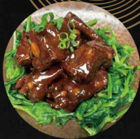
House Special Ribs