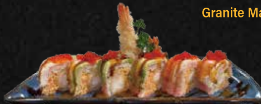
Gold Fish Maki