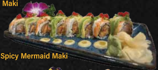
Spicy Mermaid Maki