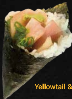
Yellowtail & Scallions Hand Roll*

Eel, cucumber, topped with avocado & eel sauce