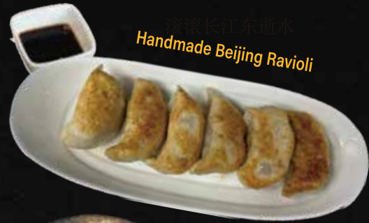
Handmade Beijing Ravioli