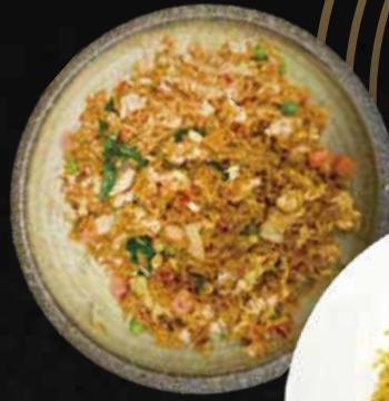
Basil Fried Rice