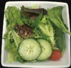
Mixed Green Salad