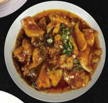
Chili Fish Filet

Chili Sauce Beef or Fish Filet $21.95 水煮牛/鱼片 in chili peppercorn sauce