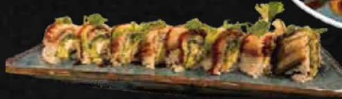
Fancy Eel Maki