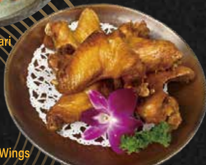
Crispy Chicken Wings