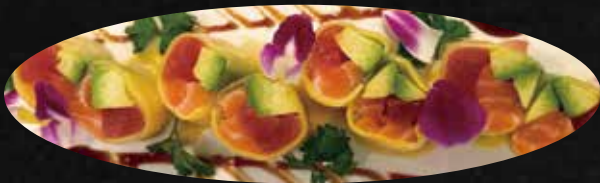
Mango Special Roll

Tuna, salmon, yellowtail, avocado, tobiko, wrapped with thinly sliced cucumber, served with ponzu sauce on the side