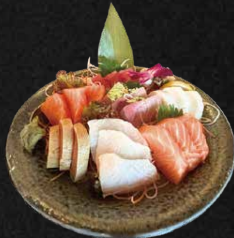
Sashimi (3 pcs / Order)

* Some items are cooked to order and may be served raw or undercooked. Consuming raw or undercooked meats, poultry, seafood, shellfish or eggs may increase your risk of foodborne illness. Before placing your order, please inform your server if a person in your party has a food allergy.