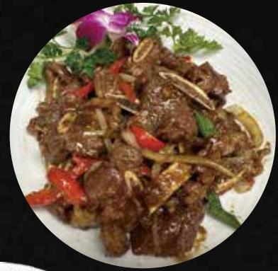
Black Pepper Short Ribs

Choice of ginger & scallion, salt & pepper, or typhoon style (crispy garlic)