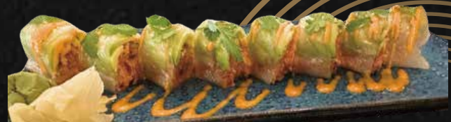
Amazing Roll*(no rice)

Spicy tuna, avocado, mango, cilantro wrapped with rice paper & spicy mayo