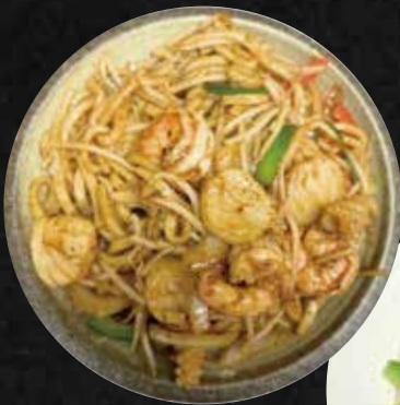
Seafood Yaki Udon

House Lo Mein $14.50 With chicken, shrimp, roasted pork & vegetable