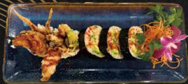
Spider Roll (Soft Shell Crab)