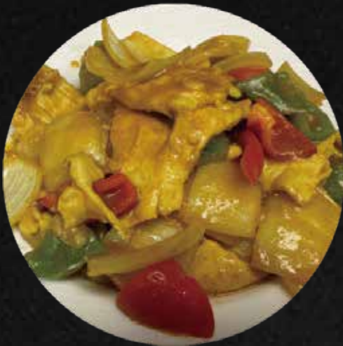
Curry Chicken with Mixed Vegetables 🍴