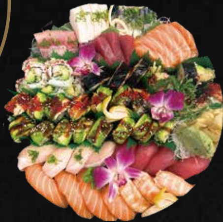
Feng Shui Party Tray*