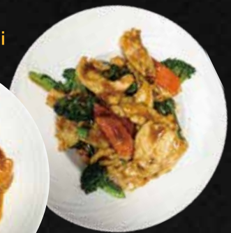
General Gao's Chicken