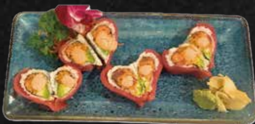
Sweet Heart Maki