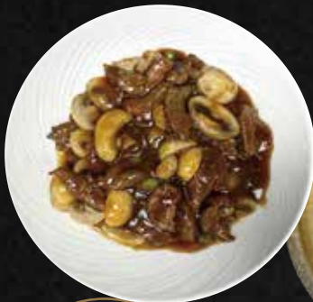
Beef with Mushrooms

Sesame Crispy Beef $18.95 Orange Flavored Beef $18.95 Beef with Mixed Vegetables $16.95 Beef with String Beans $16.95 Beef with Mushrooms $16.95 Basil Beef $16.95 Beef with Broccoli $16.95 Beef with Garlic Sauce $16.95