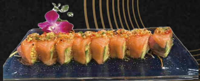
Lady Exotic Roll*(no rice)

Fresh lobster, mango, avocado wrapped with soybean paper, topped with tuna, spicy mayo & eel sauce