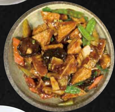
Homestyle Braised Tofu