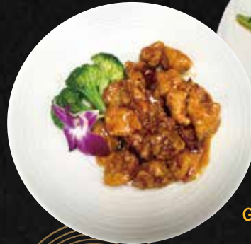
Chicken with Broccoli

General Gao's Chicken $16.95 Orange Flavored Chicken $16.95 Sesame Chicken $16.95 Sweet & Sour Chicken $14.95 Kung Pao Chicken $15.95 Chicken with Broccoli $14.95 Basil Chicken $15.95 Curry Chicken with Mixed Vegetables $14.95 Chicken with Mushroom & Snow Pea Pods $15.95 Chicken with Cashew Nuts $14.95 Chicken with Garlic Sauce $14.95