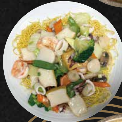
Seafood Pan-Fried Noodle