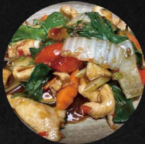
Basil Chicken 🍴