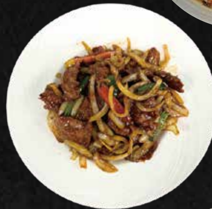
Mongolian Sesame Beef

Pineapple Shrimp with Walnuts $21.95 核桃虾 Lightly breaded shrimp served in sweet tropical pineapple creme sauce with walnuts