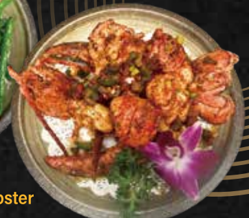
Salt & Pepper Lobster