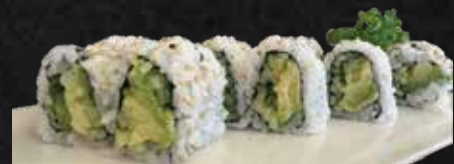
Avocado Cucumber Maki