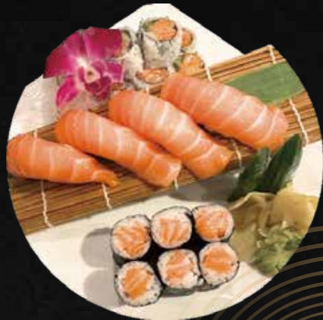
Salmon Lover Combo*