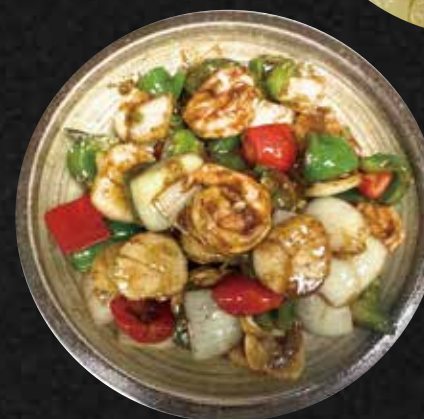
Black Pepper Duo

Mongolian Sesame Beef or Shrimp $21.95 蒙古牛/虾 Sauteed with onions, scallions, sesame seeds in our chef's special soy sauce